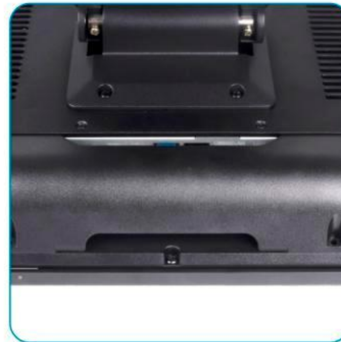
Clip & Hoop Cover for cabling