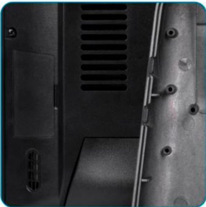
Port for MSR