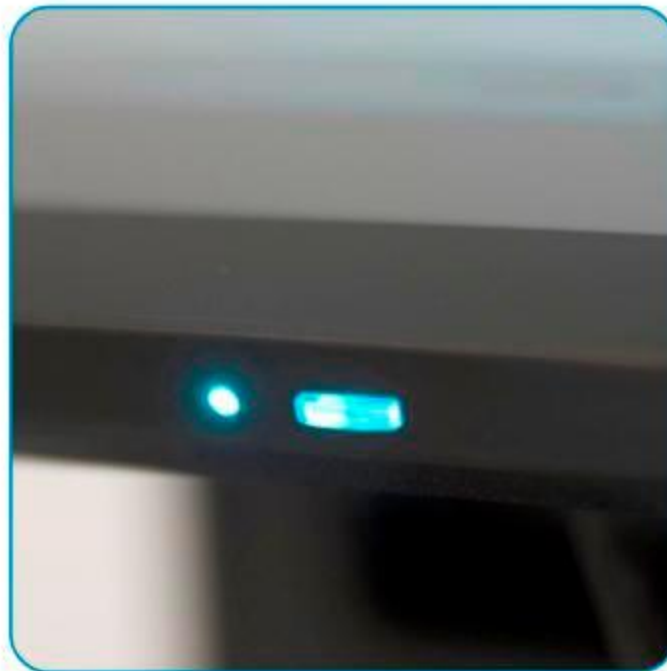
Light Blue Power Indicator